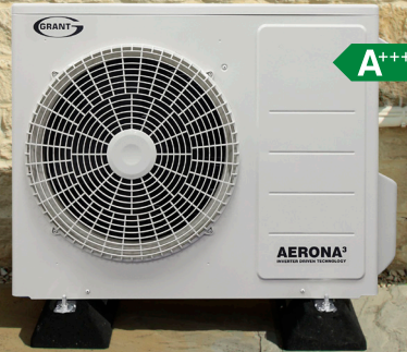
AERONA 3 R32 air to water, air source heat pump