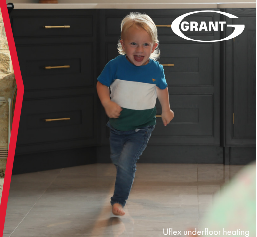
Uflex underfloor heating